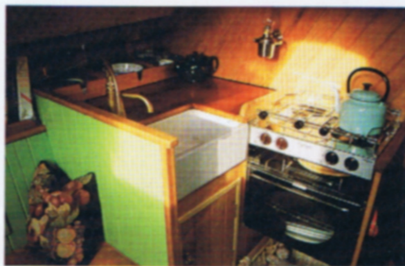
ABOVE: The hand-crafted interior of Lucie B showing the galley – a blend of the traditional and the modern