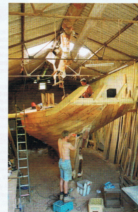
▲ Lucie B 's counter-stern added a considerable amount of time to the build

unassuming modesty shackled to a determination, sense of self-belief and boundless energy to work flat out is inspirational and could even fill you with disbelief.