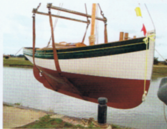
▲ Lucie B being gently lowered into the water for the first time

Once she was all planked up, the number of tasks and aspects of the