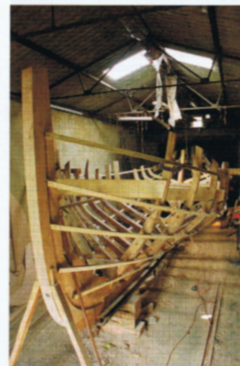
▲ Without following a strict set of plans, Ashley determines the shape by eye