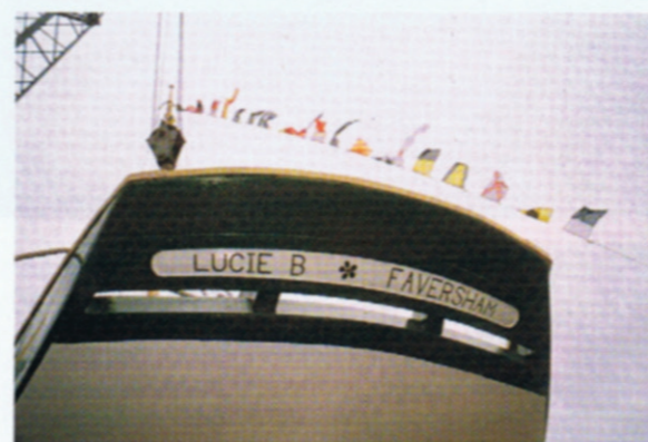
▲ Ten days at the Southampton Boat Show generated lots of enquiries and expressions of admiration

possible to see her profile from a distance. The first major deadline had been reached. Dressed overall, in front of a crowd of 70 well-wishers, Lucie B was named after my cousin and blessed as she was lowered into the water at Iron Wharf, Faversham.