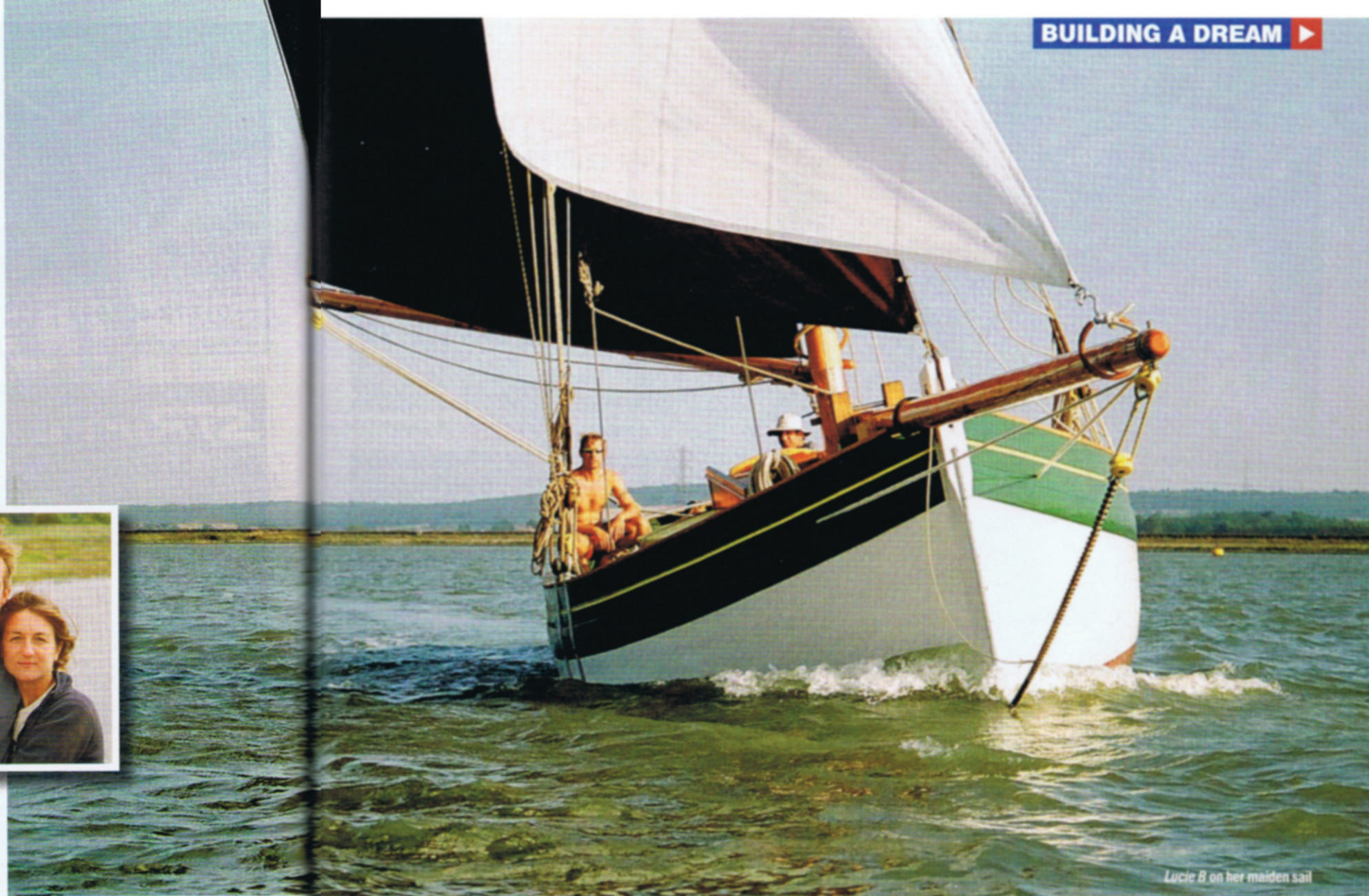
Lucie B on her maiden sail