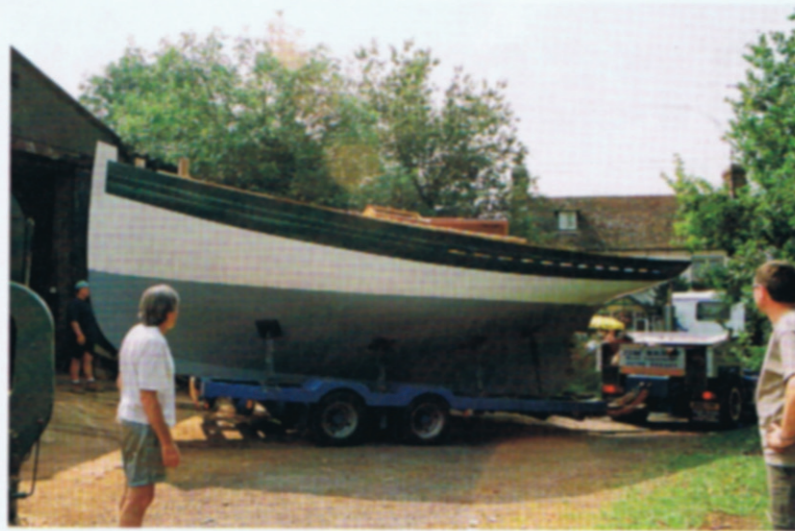
▲ Lucie B proudly emerged from her shed. It was the first time it was possible to see her profile from a distance

Estuary and uses the same traditional techniques as boatbuilders from the 19th Century.